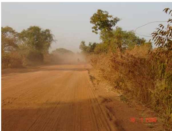
Typical laterite gravel road. Generation of dust is a constant hazard to inhabitants living nearby and their crops as well as posing a serious road safety problem to overtaking motorists