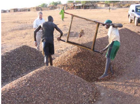
Sieving and stock piling of gravel into various sizes – all ready for sale