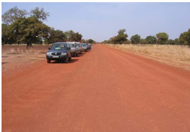
Typical engineered gravel Regional road between Fana and Dioila (R18)