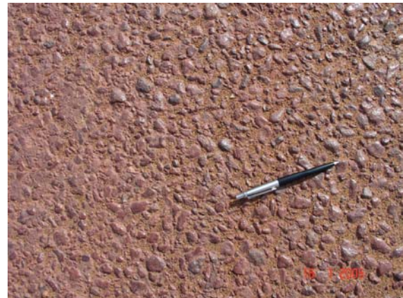
Double bituminous surfacing using river gravel; constructed in 1997, still performing very well.