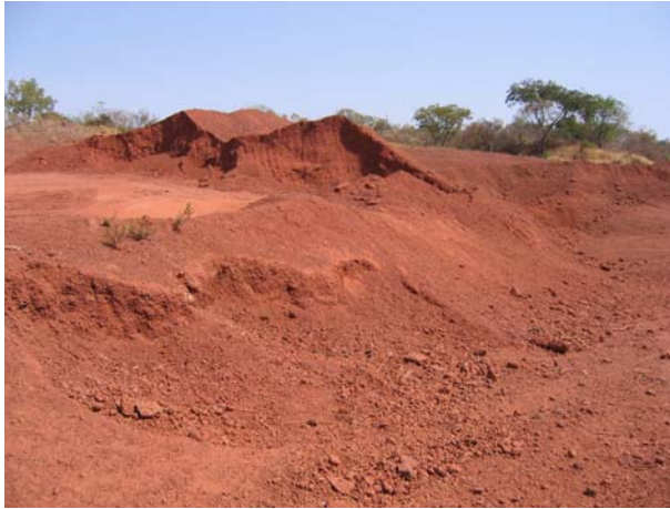
Stock piled, as-dug wearing course material from laterite borrow pit