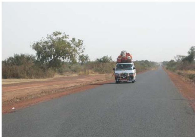
Typical bitumen surfaced National road between Bamako and Ouelessebougou (N7)

2.5 General: The site visits allowed a representative cross-section of roads to be inspected ranging from bitumen surfaced National Roads, through engineered gravel Regional Roads to un-engineered earth/gravel Local Roads. These typical road types are illustrated below: