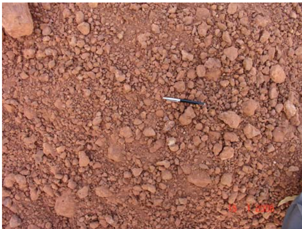
Laterite nodules, when hard enough, can be screened to produce a satisfactory aggregate for a bituminous surfacing