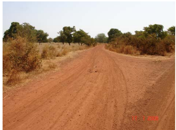
In high rainfall areas (> 1000 mm /year), such as in the cotton growing region of Mali, gravel loss is very high and regraveling is required every two to three years.