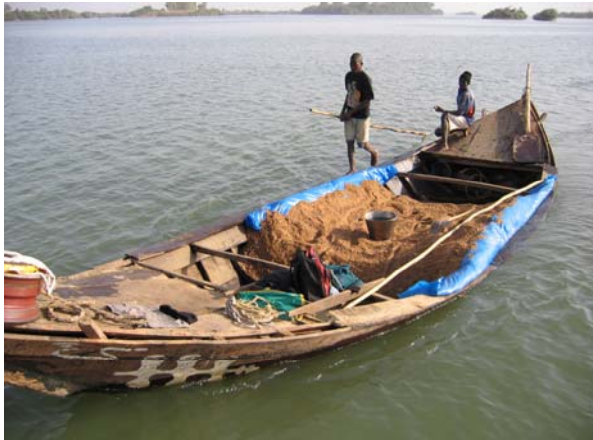
Extraction of gravel from the River Niger – a tedious, time-consuming activity yielding typically about 2 – 3 cubic metres per day