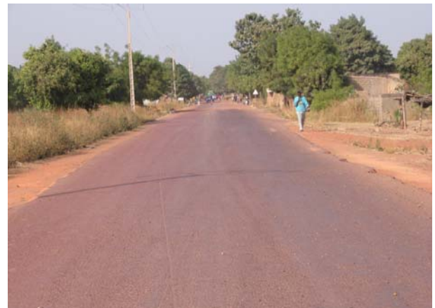
Typical bitumen surfaced National road between Bamako and Koulikoro