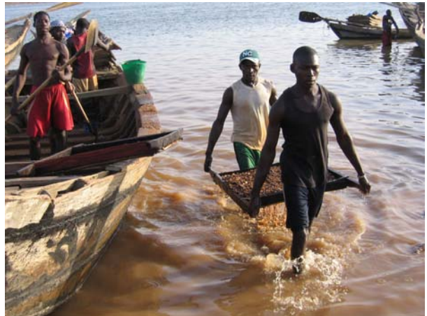
Off-loading and washing of gravel to remove fines prior to stock piling on the river bank