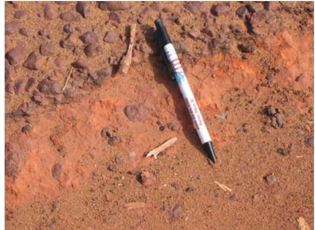
Nodular laterite used as basecourse on national road between Bamako and Koulikoro