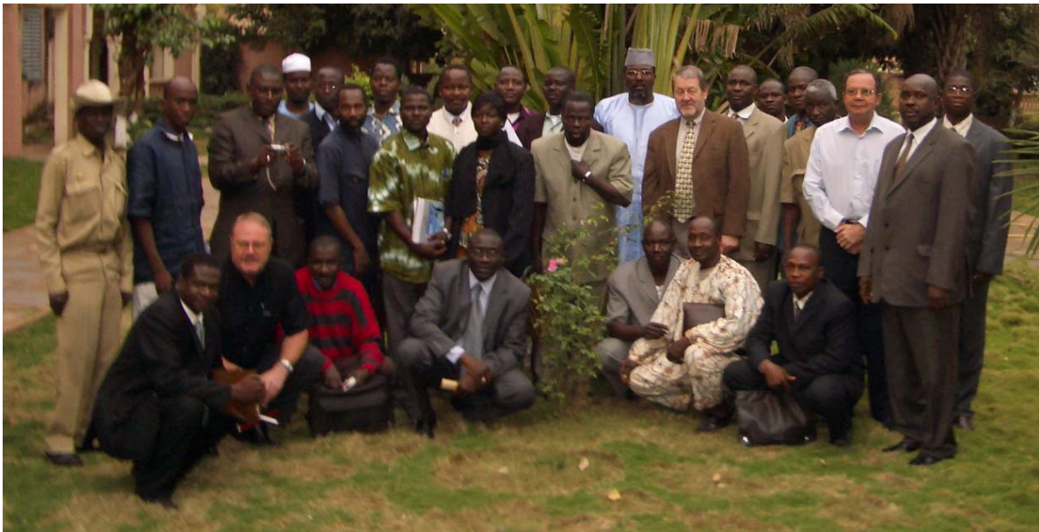
Participants attending workshop on Appropriate Pavements and Surfacing Technologies for Low-volume Roads that was held in Bamako, Mali, 15 – 16 February, 2006

3.3 The workshop was attended by some thirty four delegates including three each from Senegal, and Burkino Faso. The attendance list is attached as Annex C.