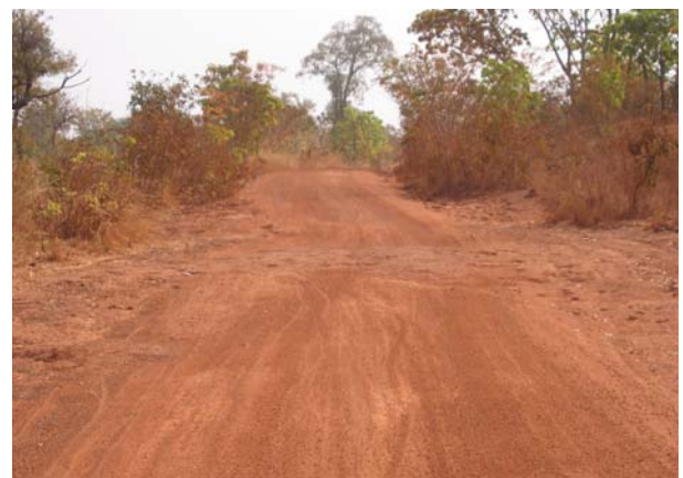
Typical un-engineered, gravel roads in cotton growing area south of Bamako